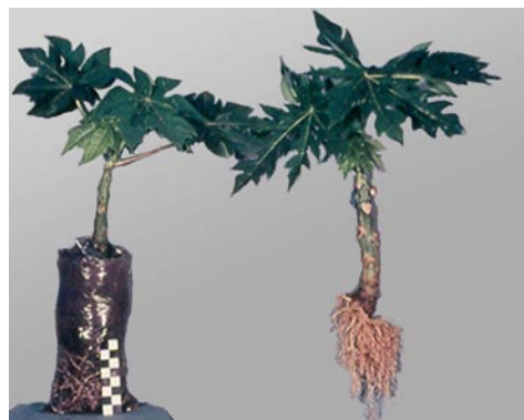
Pawpaw cuttings

A pawpaw leaf has 750 stomata per square millimetre, one of the highest stoma densities, and on all dry days in cool subtropical or temperate countries, pawpaw trees die of acute water stress. Solutions that we tried and that worked are: whitewash spray on the exposed upper leaves and white netting all over the plantation.