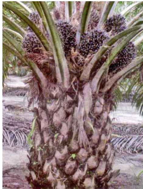
Elais guineensis, the African Oil Palm is a native of Nigeria. The oil derived from its seeds has been used for cooking for a long time. This is the primary species being planted in the new oil palm groves in South East Asia.

http://www.guardian.co.uk/indonesia/Story/0,,2049671,00.html?gusrc=rss&feed=12