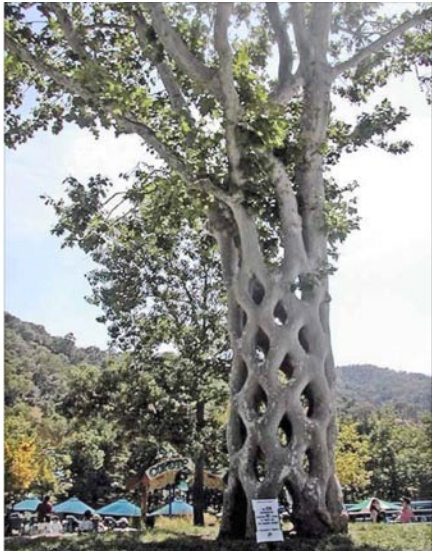
The 'Basket Tree'. This tree is actually six sycamores grafted together in 42 different connections to give it its basket shape.)

The collection of unusual trees often appeared in Ripley's 'Believe-It-or-Not' and other magazines during the 1940s and 50s. These trees represent one of the most visible demonstrations of the love of nature by man - first to create and nourish, then to maintain, and finally to preserve and cherish these stunning creatures.