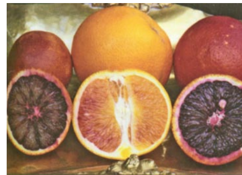
Sanguinelli, Tarocco and Moro blood oranges.

Mutations from blonde to blood oranges have occurred a number of times in various citrus-growing areas of the world, probably first in China, in or near where sweet oranges originated. Of course it is possible to introduce pigmentation into mandarin-like fruits by hybridization, and this is the approach taken by Sicilian breeders. The second generation of crosses are all triploid, and thus seedless,