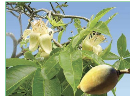
Boab ( Adansonia gregorii )