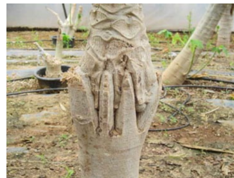
A pawpaw stem with a 'W' Graft

I grow only male and female types, usually propagated by rooted cuttings. I grow the pawpaws in plastic tunnels because I work by myself with no helpers. I graft them (W graft) on local female and male seedlings and it is amazing how you can improve fruit set by that. However, there is still a need to hand-pollinate