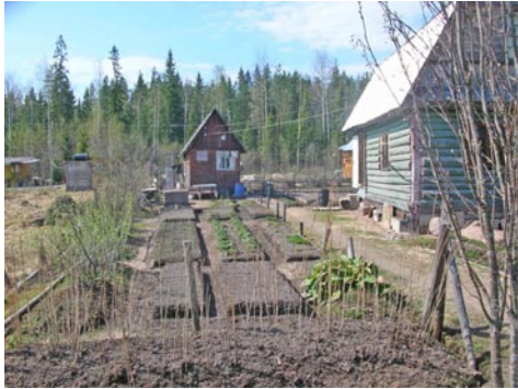
Some tidy dachas

unpleasant to live there, and gardens are allowed go fallow in winter.