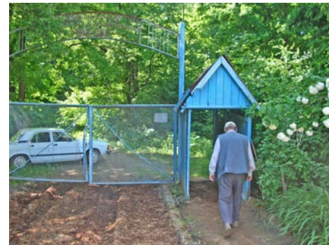
[Agrifood Infonet E-News: Issue 38, 31 January 2007]

The Institute takes very careful quarantine measures: only essential vehicles may enter a quarantine station from outside; on their entry they drive through a bed of sawdust dosed with anti-fungal agents. People have their footwear similarly treated as they enter by walking through a special passage of sawdust. The photo below shows a man exiting the station through the personal passage to his car left outside the locked gates.