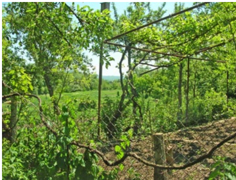
Kitchen garden plot under an arbour of fruit trees and grape vines

Dachas were promoted a lot, especially in Brezhnev's time, to make a significant contribution to the food supply. Many have fertile soil and are very productive. Each garden is uniquely individual. Flowers are mixed in with vegetables. Frequently, fruit and nut trees, and in the south of Russia, grape arbours make cool, shady places in summer. Popular trees for gardens include apples, pears, walnuts and hazelnuts. Often, they grow very tall. In the northern parts of Russia and Siberia, berries are favoured, especially on acidic, peaty soils.