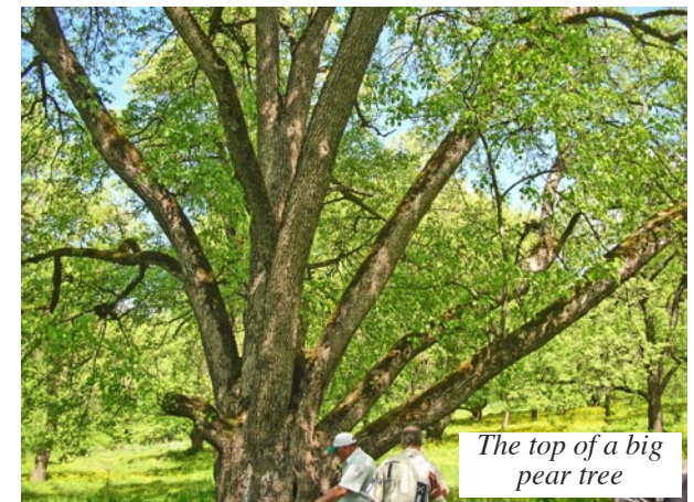
The top of a big pear tree