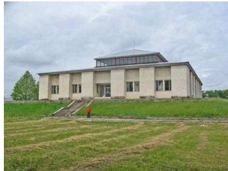
The Vavilov Institute Seed Bank Centre in Kuban, Caucasus region

of the premier plant research organisations internationally, and has included Vavilov in its name since 1967. It includes facilities for storing a collection of about 350,000 accessions of gene types representing about 2500 plant species including wild and cultivated corn, potato tubers, grains, legumes, fodder, fruits and vegetable seeds in various parts of Russia. The main centre for this collection is in the Caucasus region. Its building has an earth berm to help maintain the conditions needed to protect the cooled and frozen, dehumidified seeds and other genetic materials stored in its cellars.