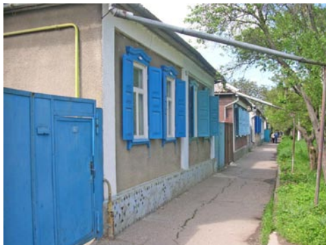
The overhead gutters deliver rain water to trees and plants on the verge.

Particularly in the Caucasus region, kitchen gardens are made on the street verges between the road and footpath. Houses are built right up to the edge of the footpath, and pipes from the roof gutters carry the rain over the footpath into the verge gardens. The plants are packed in closely. As well as being highly productive, these gardens create streets of great beauty with their mix of trees, bushes, vegetables and flowers. The microclimate created by the gardens moderates the heat in summer.