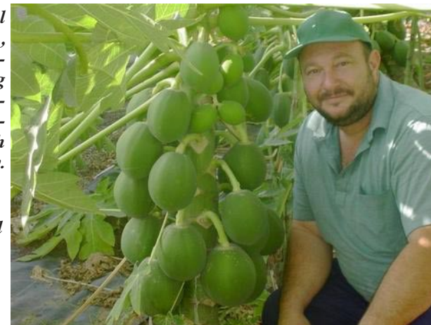
Ariel and a short pawpaw plant

The URL has a useful botanical database: http://delta-intkey.com/angio/