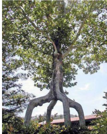
The 'Four Legged Giant'