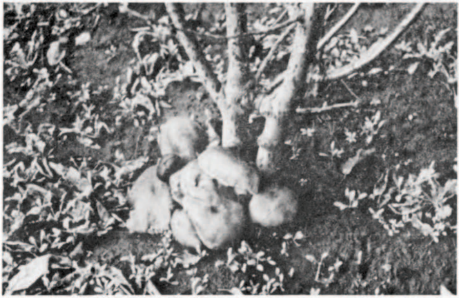
Clusters of brown mushrooms at the base of an affected tree.